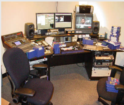
Post Production Video / Audio Equipment

We have an excellent record successfully reselling ex-lease assets to end user (retail) markets worldwide.